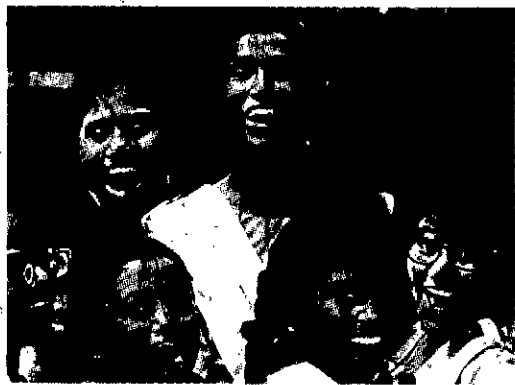
Students of Viqarunnisa Noon School and College rejoice after the SSC results were published yesterday.

Nahid says new evaluation system getting 'standard right'