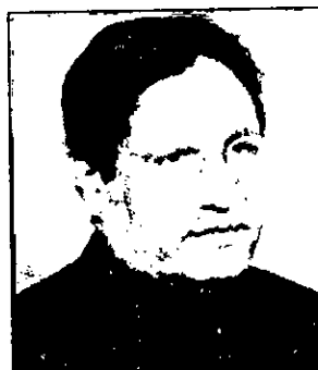
Ahad Ali Sarker

The state minister is a freedom fighter who fought the liberation war of Bangladesh in Sector No-2 in 1971.