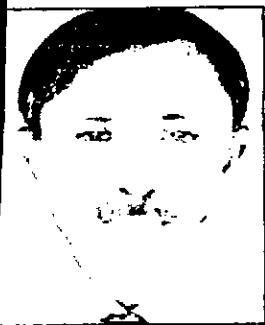
Mostafizur Rahman Fizar

Newly appointed State Minister for Environment Mostafizur Rahman Fizar was born at Phulbari upazila in Dinajpur on November 29 in 1953.