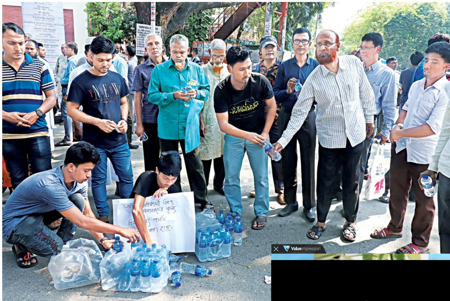
Buet students distributing free bottled water among guardians of examinees during the admission to campus on a bike about 10 minutes after the tests began and is helped by a volunteer