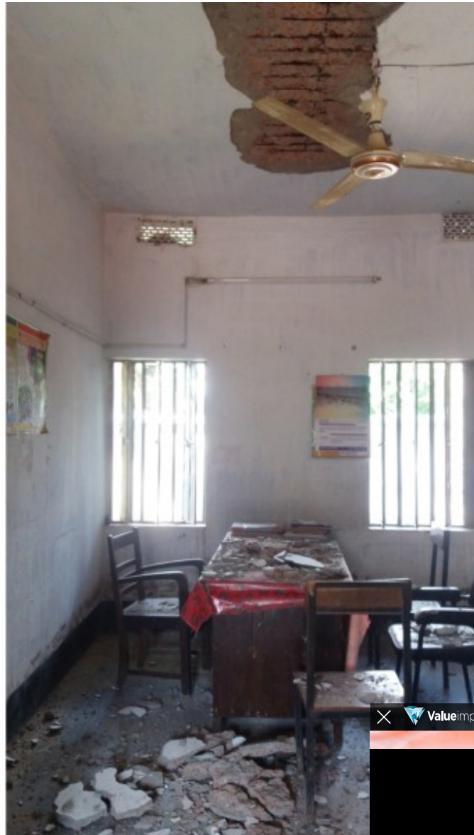
Heavy chunks of concrete fell from the ceiling in this teachers at Madhabpur High School in Moulvibazar's on Saturday evening.