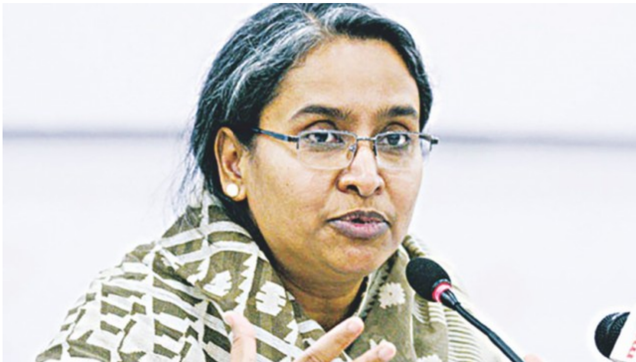
Education Minister Dr Dipu Moni.