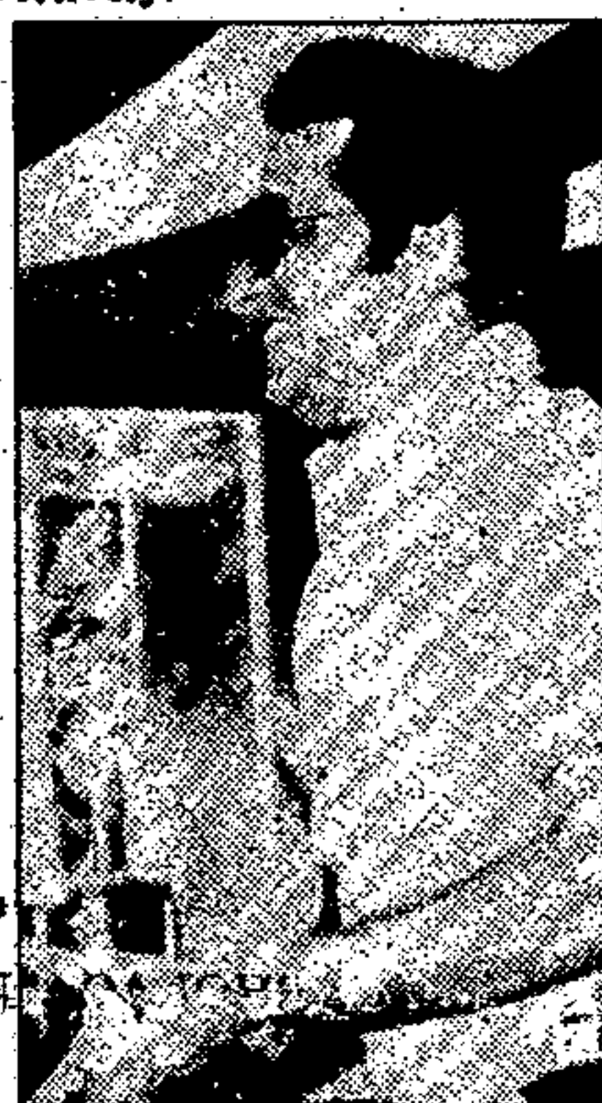
Best Actor: Razzak.