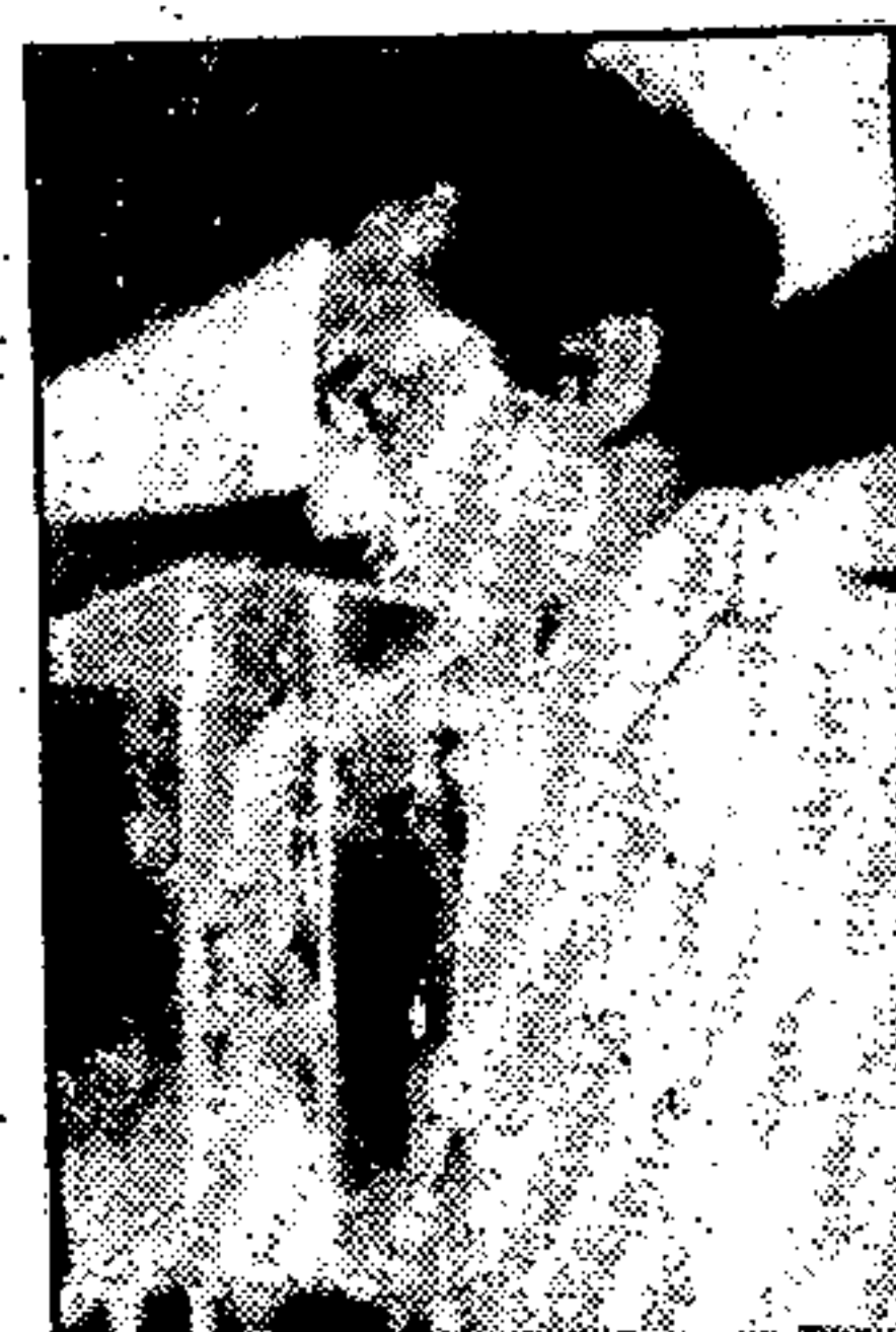
Best Supporting Actor: Anwar Hossain.