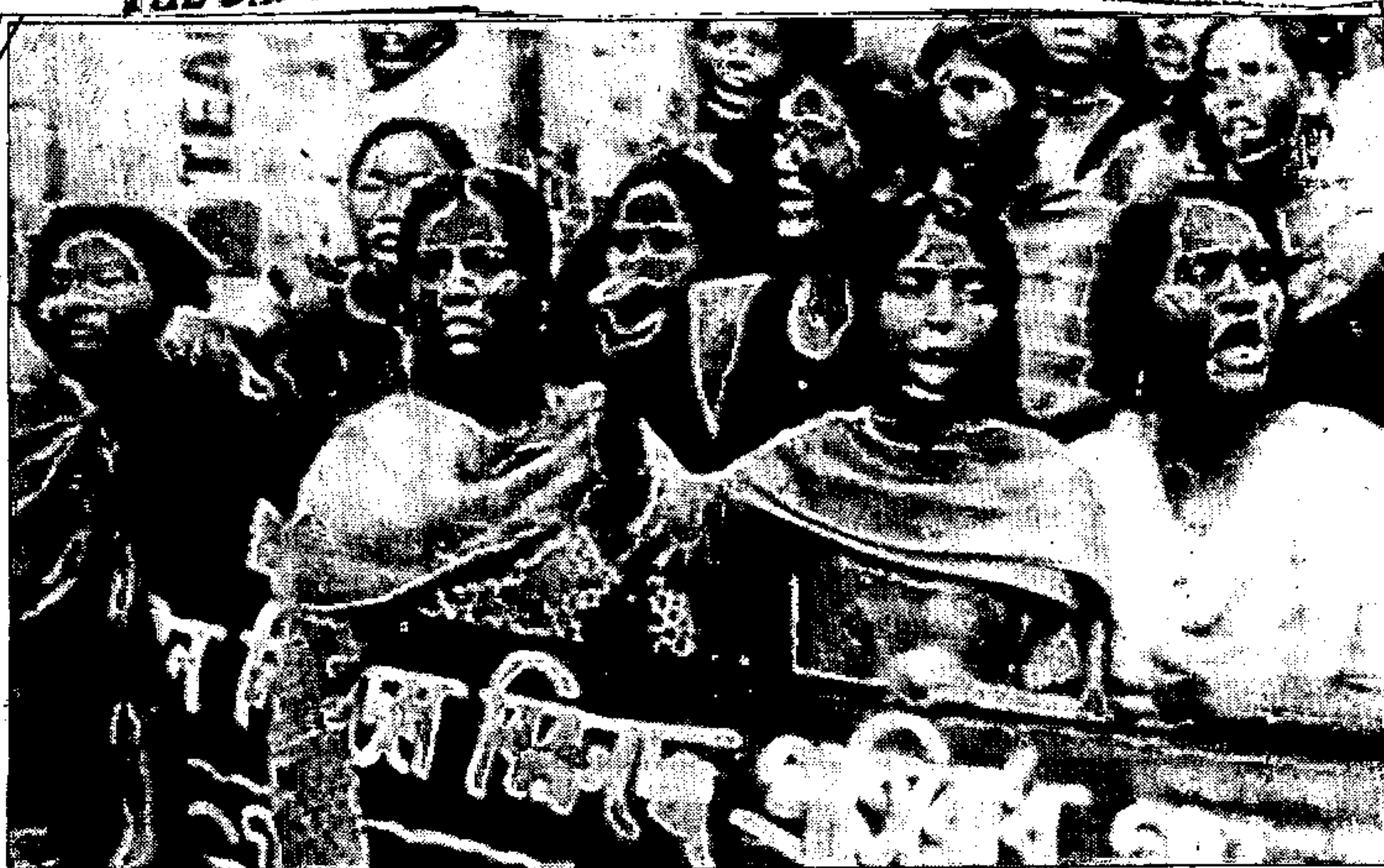
A section of 'general students' demonstrating against the sex-scandal of a teacher brought out a procession on Dhaka University campus on Monday protesting attack on them on Sunday.