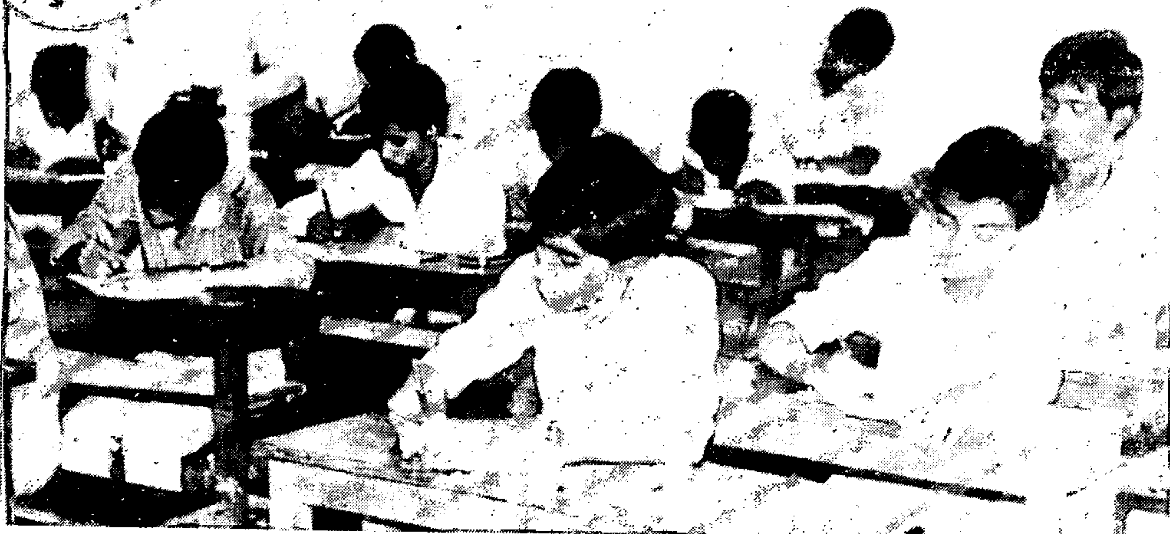
SSC examinees at a city centre